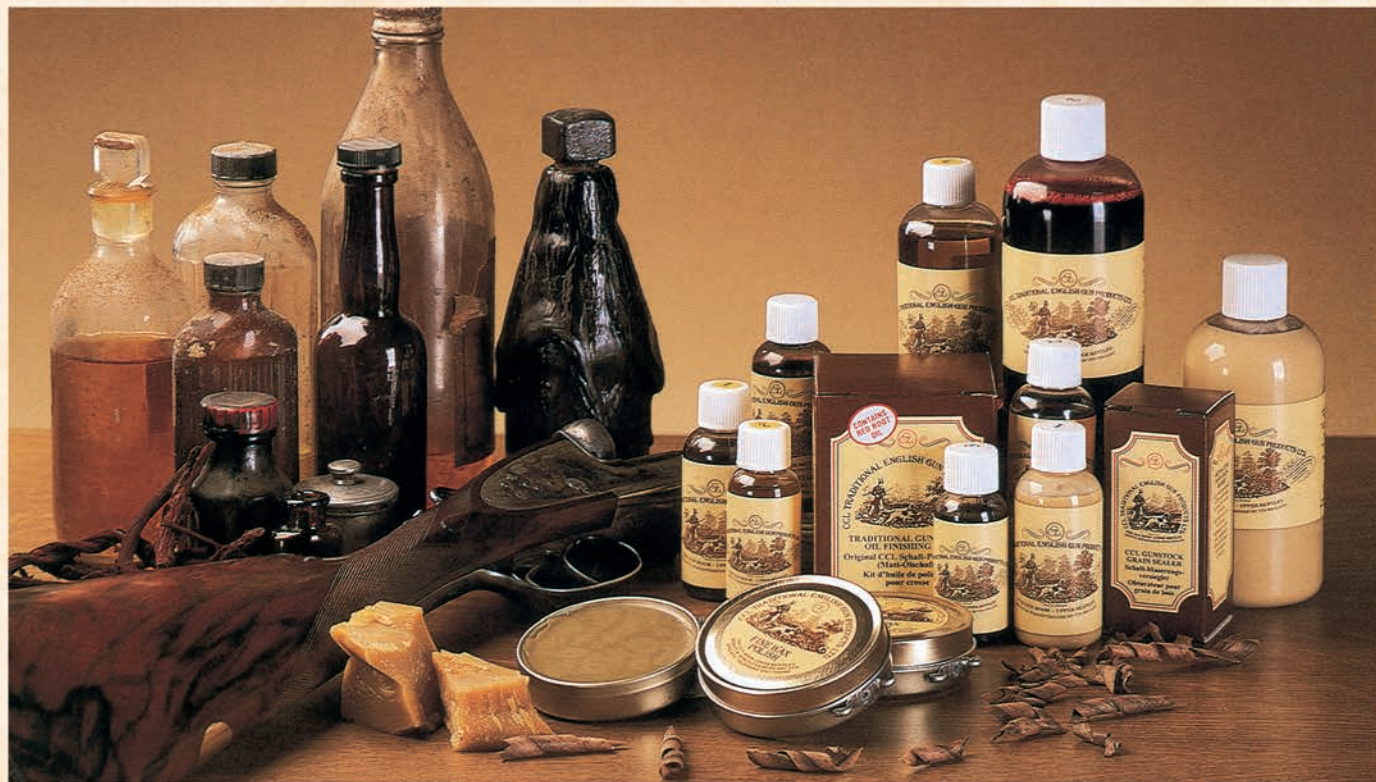
OLD ENGLISH TRADE RECIPES IN NEW BOTTLES ~ HAND BLENDED FROM THE FINEST TRADITIONAL INGREDIENTS